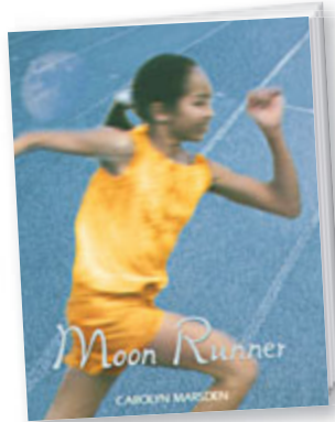
Main Selection Moon Runner